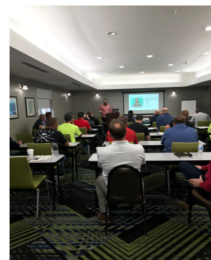
"Good to the Last Drop" will be offered Fall 2022!

At Process Solutions, Inc. we're committed to being your full-service supplier of water treatment products, systems and services. We do this by providing our customers with high quality products, great service and all at competitive prices . Please feel free to call us with your feedback and suggestions as to how we can be of service to you.