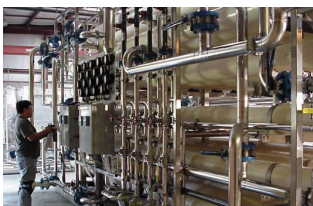
When it comes to water, we’re your full-service supplier!!