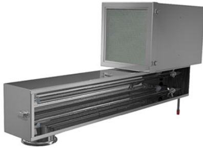
UV Unit mounts on top of the tank to keep the sidewalls clean and bug-free!

When was the last time you opened up your RO storage tank and the walls above the water level were slimy and nasty? Because of their warm, moist environment, these are ideal breeding grounds for bacteria. Something our friends in the beverage industry have known for years that might benefit the rest of you – UV for the headspace above the water level!