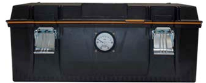
The Black Box from Avista Technologies

Concentrate – to identify potential scale formers, evaluate antiscalant performance, or optimize recovery rates.