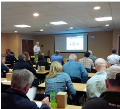
“Good to the Last Drop” is coming again in September 2015!

Invitations will be going out when the time gets closer, but please pencil in these dates on your calendar. In the meantime, if you have questions or want further information, please contact us at 513-791-3338!