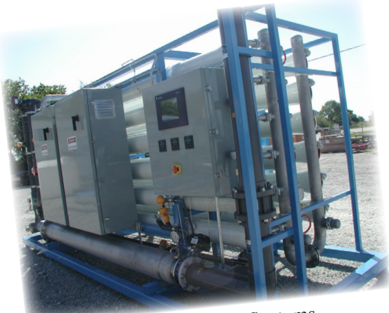
Membrane Filtration Systems