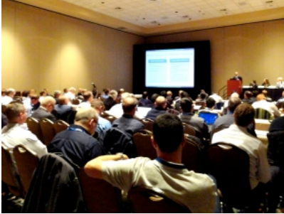
The AMTA Technology Transfer Workshop is coming to Columbus, OH!

Even in cases where further treatment is required to reclaim a waste stream, the economics are becoming increasingly attractive. To evaluate the feasibility and economics of possible reclaim applications for your facility, please contact your Process Solutions, Inc. sales representative for a consultation.