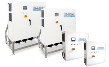
Corona discharge ozone systems

If you would like additional information on ozone generators, application or design considerations, please contact your Process Solutions, Inc. sales representative at 513-791-3338 .