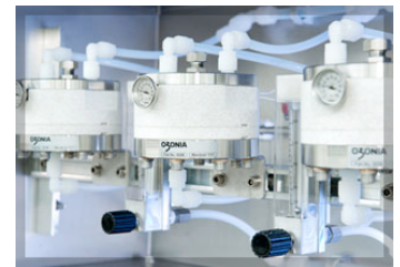
Electrolytic ozone generators