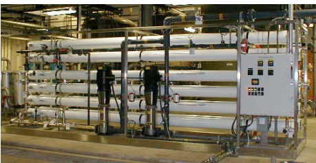
Recovering the concentrate from your RO system makes good environmental and economic sense!